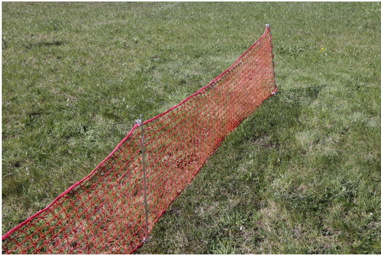
SZS18-150 SZS15-120 SZS14-100 SZS17-25 © 2019 Polanik

The producer reserves the right to introduce without warning changes in product constructions and colours.