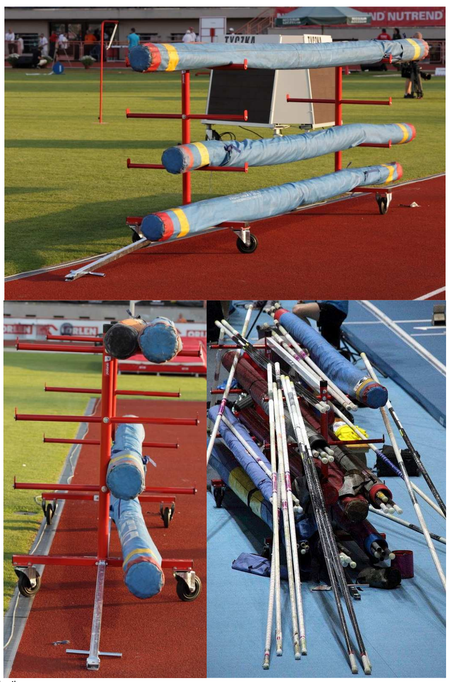
PC-S0438 © 2014 Polanik

Even the best technical solutions cannot substitute for common sense. The usage of the product must take place under the supervision of sports facility technical staff. The producer shall not be liable for any incidents caused by the improper assembly or misuse of the product. We reserve the right to alter without prior notice the construction and colours of the product.