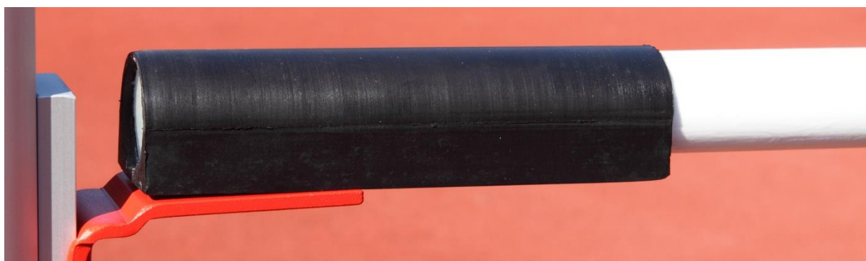
Training and school crossbars